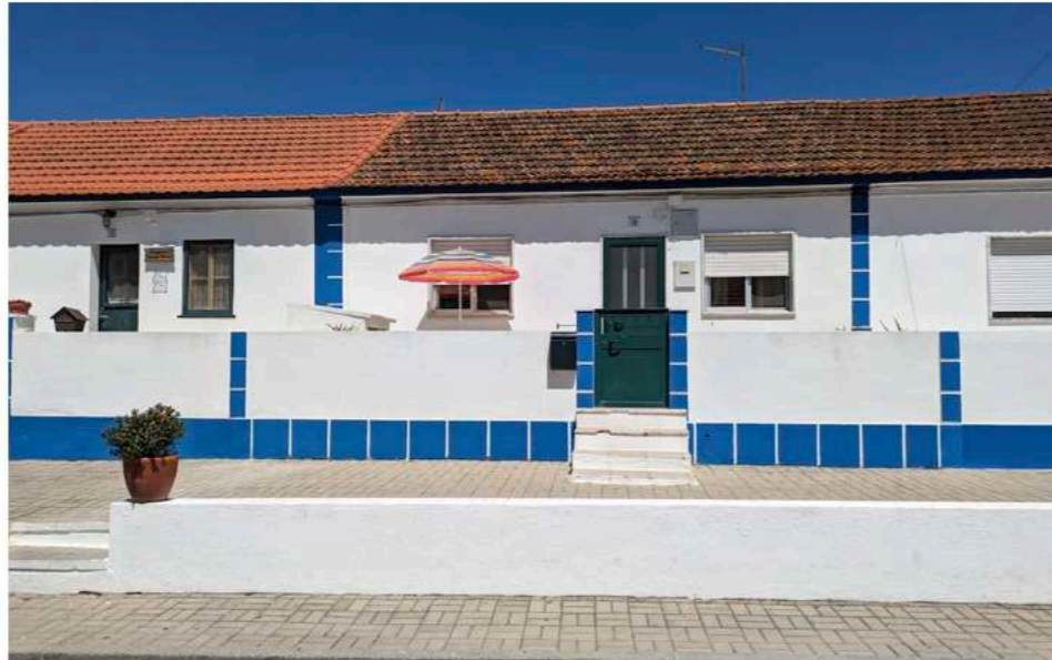
Comporta's distinctive white and blue buildings run onto a magnificent stretch of beach.

Choosing just one favourite seaside resort in a country with many thousands of miles of coastline is tricky, but I'll plump for Comporta . Despite being increasingly famous for the A-list residents who live around it, you will still probably see more storks, perched on bell towers and chimneys, than humans on the glorious stretch of seaside. The village itself has maintained its charms, and is filled with characteristic white-washed buildings with blue trim. Step inside any of the enticing shops, though, and there is a definite South of France flair. This is a Mediterranean meets the Atlantic delight. Chic and breezy.