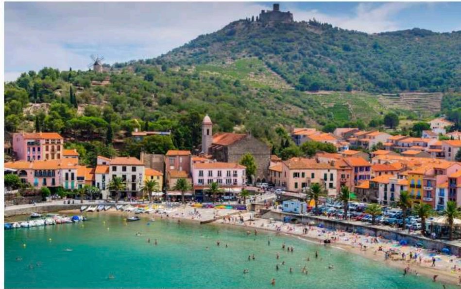
Collioure – come for the Occitanie beauty, stay for the tiny fish

How cool does a place have to be to get away with anchovies as its local speciality? Pretty cool – in fact, as cool as Collioure on the deep south Roussillon coast. This is the only spot on the Occitanie seaside with that sheen of glamour coating Riviera resorts further east. It boasts art, history and bronzed beautiful people by the beachful. But, though cool, it's also hot, fierce of sun, sea – and the colours which drove Matisse and Derain towards fauvism.