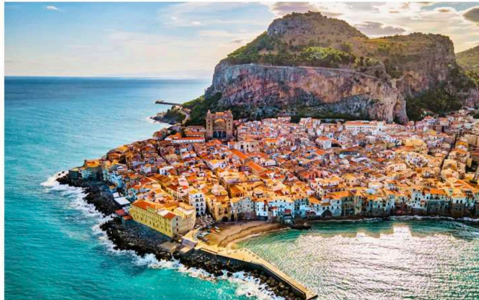
Climb to the top of the cliff overlooking Cefalù for unmatched views of the town