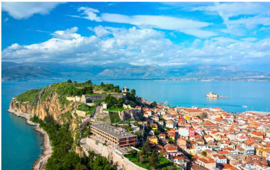
Nafplio has everything you could want from a Greek seaside town

Share icons: X, Facebook, WhatsApp, Email